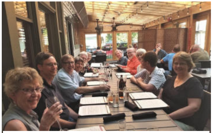
Trinity friends enjoy dinner out at The Cheel in Theinsville!

Be God's Love To Our Neighbors Every Day!!! Wear a GWOH shirt on Rally Sunday to show your commitment!