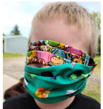
Practicing our mask wearing before 5K. We'll get there! 🥰 🥰 ❤️