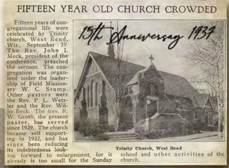
Trinity Church, West Bend school and other activities of the church.