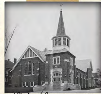
The building expansion was completed in 1957.

Ground-breaking for the expansion began in October of 1956. While construction was going on services were held in the V.F.W. club room. Services resumed in the new building on October 27, 1957.