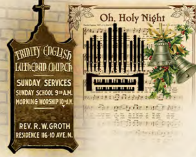
A pipe organ purchased in December 1932 would be played for the first time on Christmas Eve