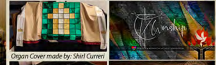
Organ Cover made by: Shirli Currier