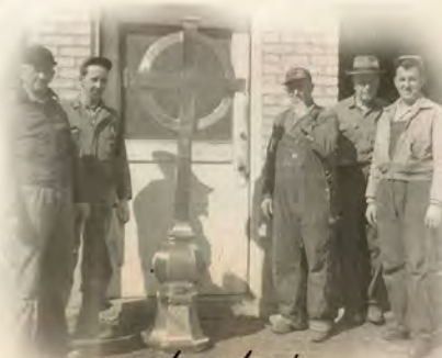
Trinity's steeple cross

In 1924 plans for a church building were presented to the congregation. They would not be approved until two years later. The church building was completed in December 1926 at a cost of $16,639.10, over one half of which was contributed by members.