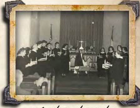
Christmas at Trinity