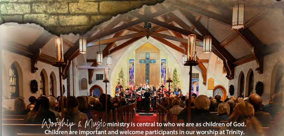
Worship & Music ministry is central to who we are as children of God. Children are important and welcome participants in our worship at Trinity.